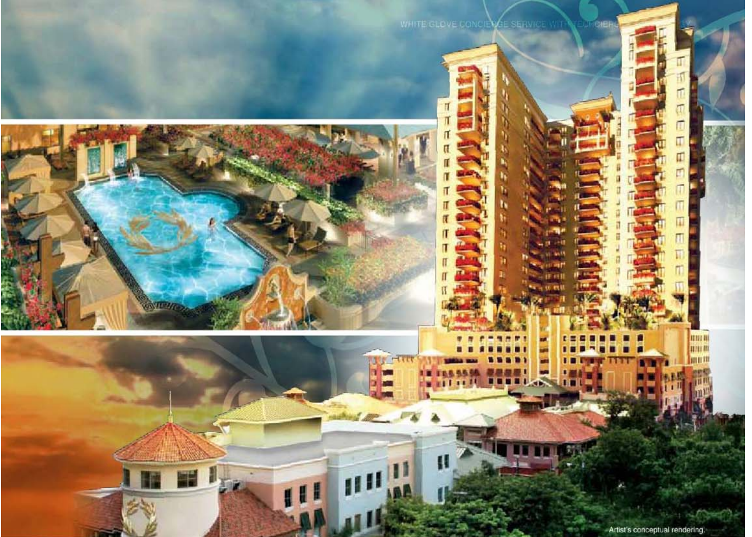
Artist's conceptual rendering.

WHITE GLOVE CONCIERGE SERVICE WITH TECH-POWERED