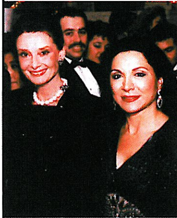
EVANGELINE WITH AUDREY HEPBURN AT UNICEF GALA